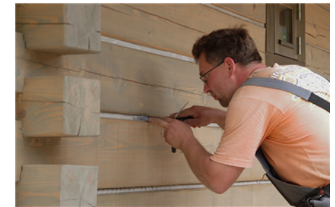
and chinking of lateral groove