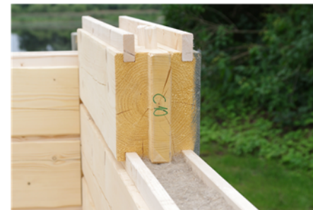
lateral groove insulation