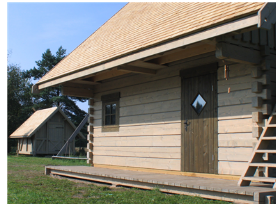
3RADI log wall with cross corner joint (wall settles about 3% of its initial height)

system provides truly ecological, weathertight log structure, avoiding of use of glue laminated wood (syntetic adhesives) and steel ties. lateral groove system evens affect of deformations of massive logs to buildings weathertightness